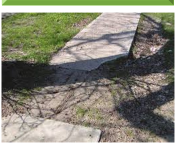
Solution: Replace or Install Missing Sidewalk Panels