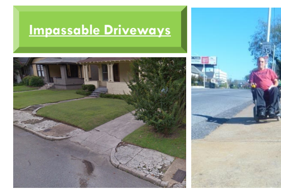
Solution: Replace Driveway with ADA Compliant Design

Solution: Replace Damaged Sidewalk Panels, Mitigation of Tree Roots or Tree Removal May Be Required